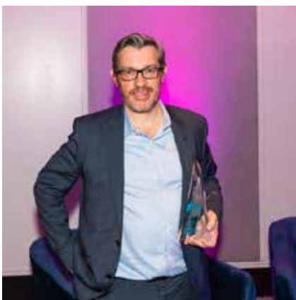
Small Company Turnaround of the Year: Brisbane Broncos Leagues Club