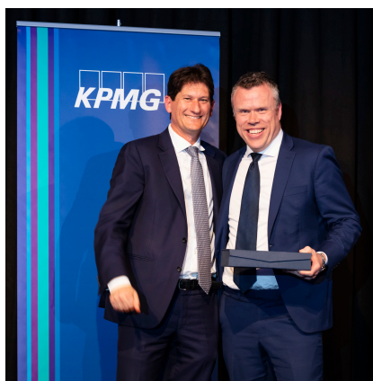
Medium Company Turnaround of the Year: Houston's Farm