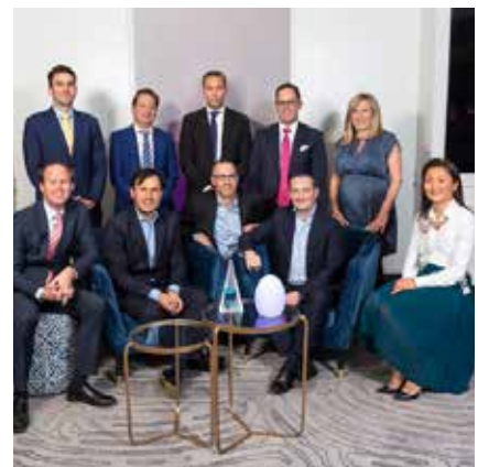
Restructuring Deal of the Year: Paladin Energy Limited