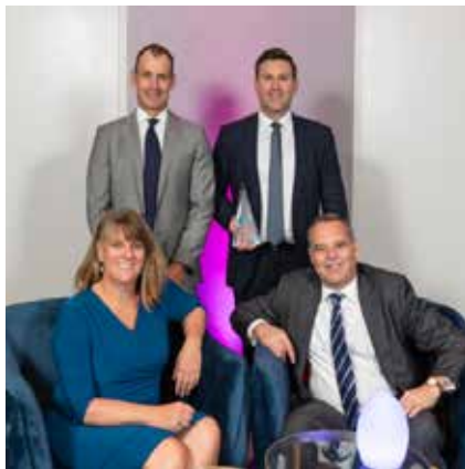
Large Company Turnaround of the Year: Ten Network Holdings